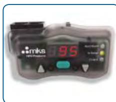
Figure 2 - Display & Communications Module

The Display and Communications Module (Figure 2) includes all the functionality of the Display Module, but adds Modbus RTU communications with an RS485 interface. This allows users to remotely adjust the operating parameters and monitor heater operating status. The temperature controller is housed inside a protective NEMA 4X rated enclosure that is resistant to water and dust. The enclosure is also resistant to corrosion and damage from ice buildup.