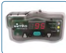
Figure 1 - Display Module

Temperature controllers are available in two different options: a Display Module or a Display and Communications Module. The Display Module (Figure 1) allows the user to locally adjust the operating parameters, including temperature set point, high/ low temperature alerts, high limit (safety) set point, control mode (on-off/PID) and related parameters. It contains an alphanumeric LED display that displays the heater's current temperature and alert condition.